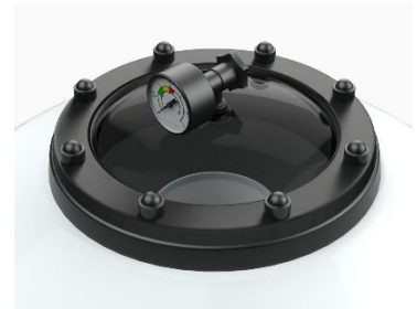
▪ Transparent lid with screws