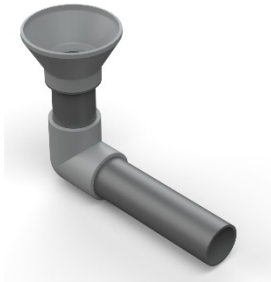
▪ Cone diffuser